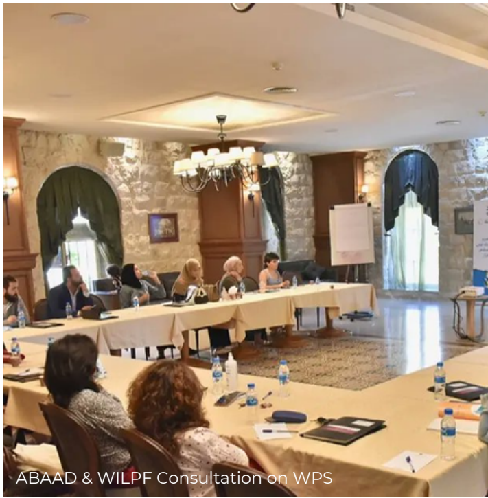
ABAAD & WILPF Consultation on WPS