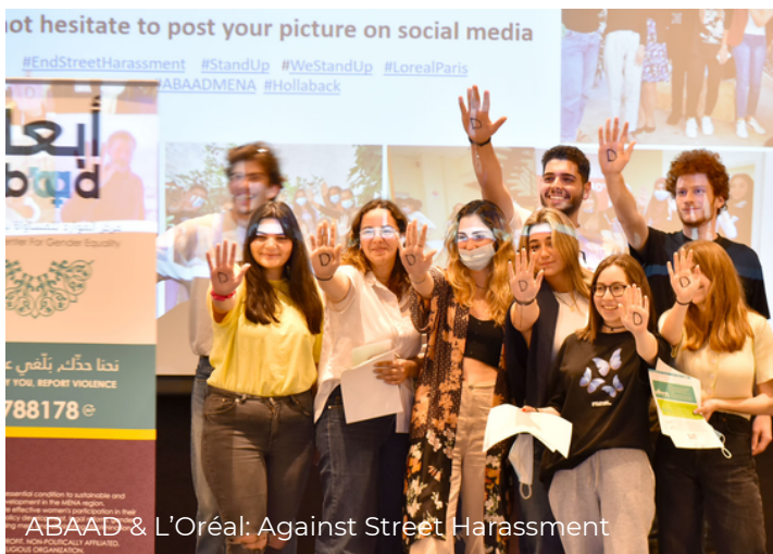
ABAAD & L'Oréal: Against Street Harassment