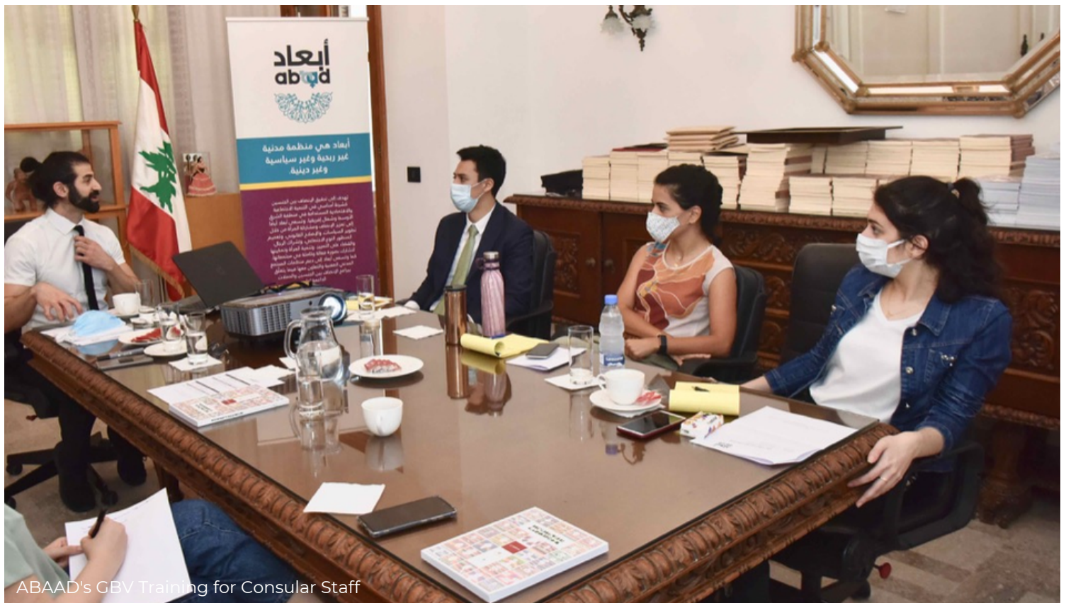
ABAAD's GBV Training for Consular Staff