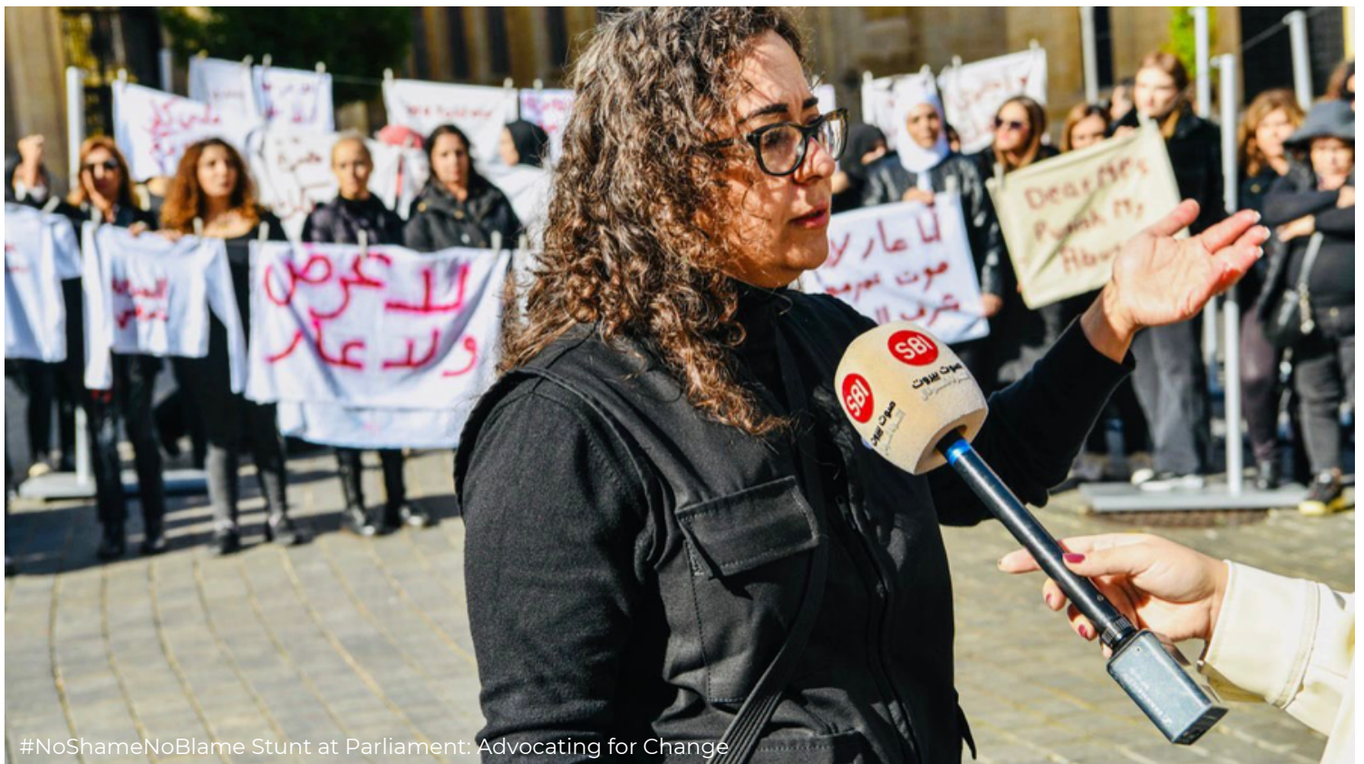
#NoShameNoBlame Stunt at Parliament: Advocating for Change