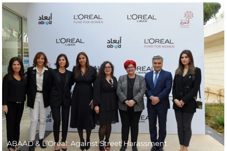
ABAAD & L'Oréal: Against Street Harassment