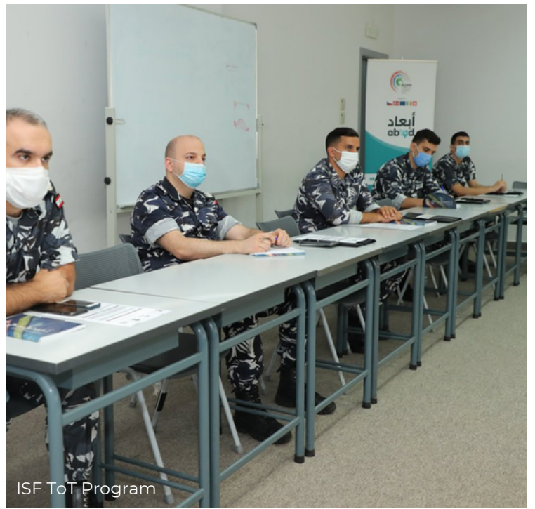
ISF ToT Program